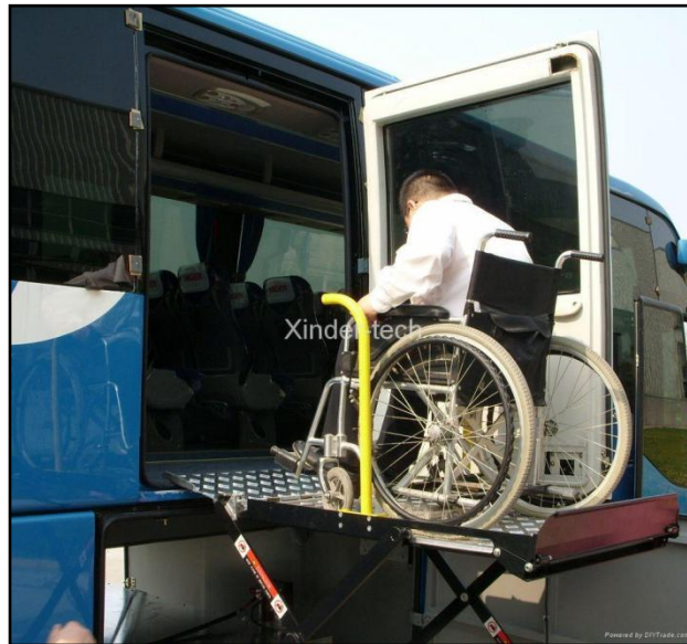
Figure 3.8: Disabled person in a wheelchair being lifted into a bus