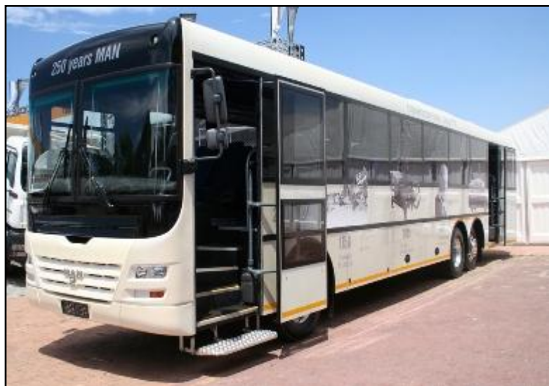
Figure 3.4: MAN high floor bus intercity buses for the FIFA 2010 World Cup