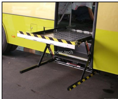
Figure 3.7: Wheel chair lift mechanism in buses