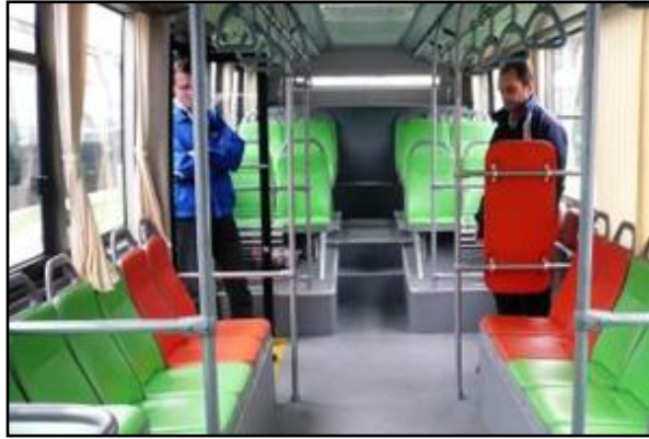
Figure 3.5: Interior of a low entry bus by Volvo