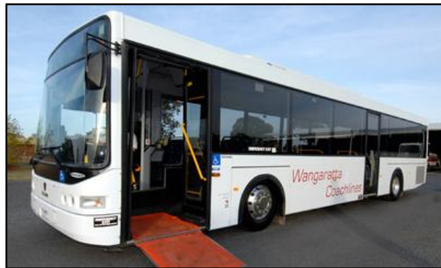
Figure 3.6: Low-Floor Entry Bus