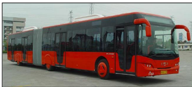
Figure 3.9: The 18.5 meter articulated bus

Despite all these factors there may be certain instances where the bi-articulated bus is the appropriate choice.