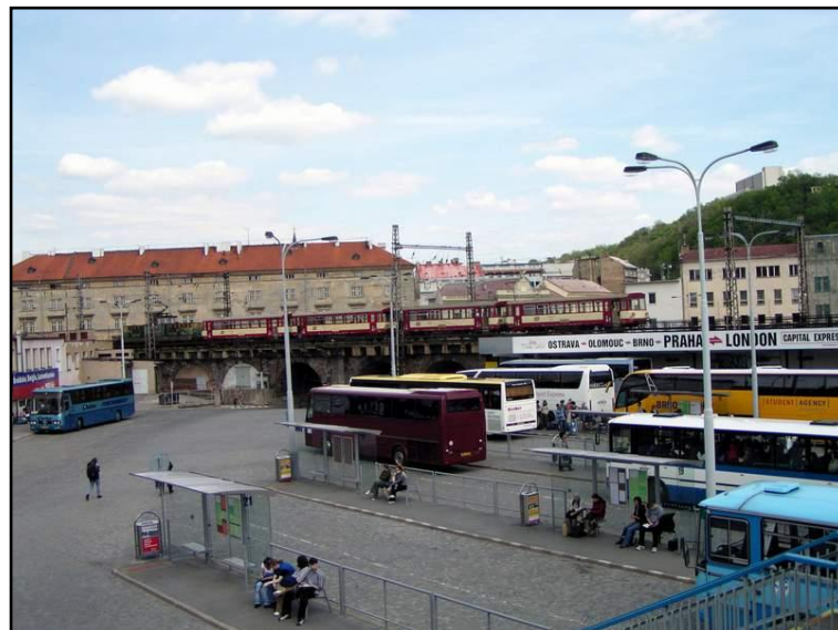
Figure 3.3: Main bus terminal Praha Florenc in Prague.

Terminals are the ending and starting points of vehicles in a public transport system. It is the main end and start point in the trip. These terminals are therefore located in business hubs or in central locations. The location of terminals must be very strategic so that the majority of the passengers will start and terminate their journey at the main terminal. This is to maximize the running cost of the service.