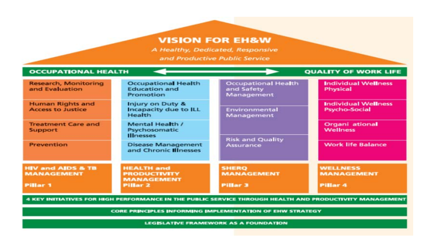
Figure 1: Conceptual framework for the employee health & wellness in the public services, 2008

All departments in South Africa are guided by and need to adhere to the 2008 Employee Health and Wellness (EH&W) framework as provided by public services currently known as DPSA. Below is a conceptual framework for the EH&W.