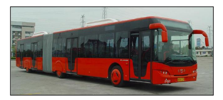
Figure 3.9: The 18.5 meter articulated bus

Despite all these factors there may be certain instances where the bi-articulated bus is the appropriate choice.