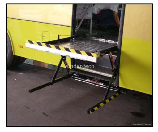
Figure 3.7: Wheel chair lift mechanism in buses

Wheel chair accessible buses: These buses usually have a lift that enables disabled passengers with wheel chairs to access the buses. These buses, even though effective, are very expensive and the use of the lift increases boarding times at bus stops.