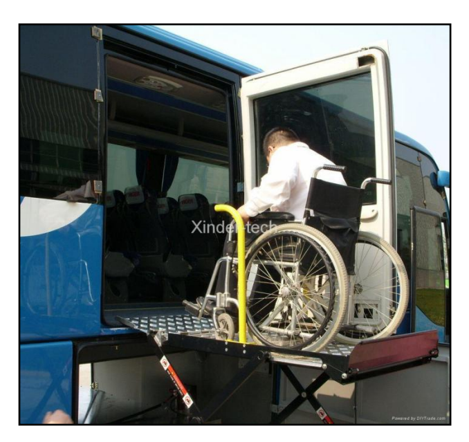
Figure 3.8: Disabled person in a wheelchair being lifted into a bus