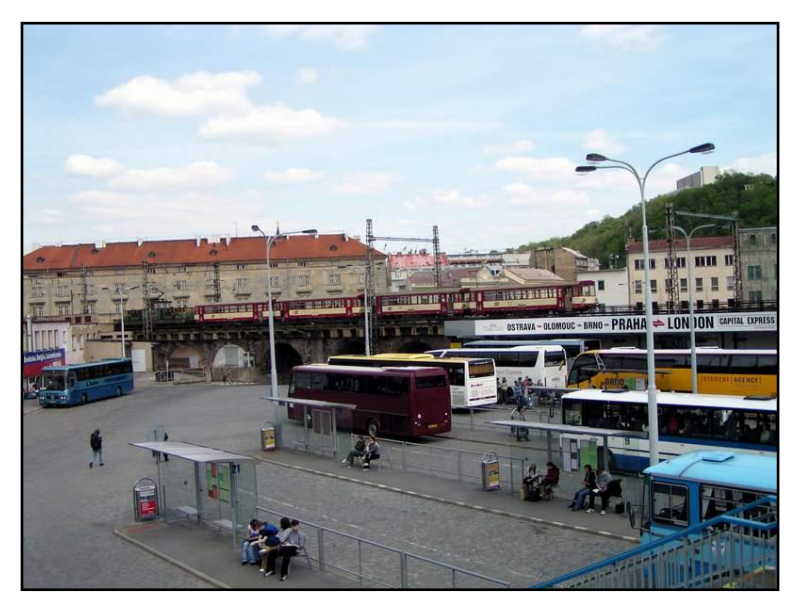
Figure 3.3: Main bus terminal Praha Florenc in Prague.

Terminals are the ending and starting points of vehicles in a public transport system. It is the main end and start point in the trip. These terminals are therefore located in business hubs or in central locations. The location of terminals must be very strategic so that the majority of the passengers will start and terminate their journey at the main terminal. This is to maximize the running cost of the service.