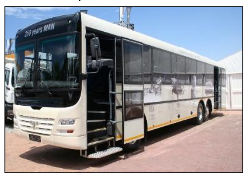
Figure 3.4: MAN high floor bus intercity buses for the FIFA 2010 World Cup

High floor buses: These buses are entered by climbing stairs to get to the floor of the bus. The bus floor is usually in excess of 1200mm above the ground. This makes this bus difficult to access for elderly and some disabled.