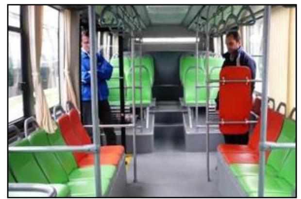
Figure 3.5: Interior of a low entry bus by Volvo

• Low floor buses: These buses have very low floor levels, usually between 350mm and 450mm. However the very low floor makes it difficult to use on any terrain.