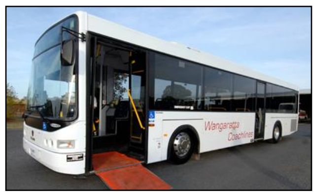
Figure 3.6: Low-Floor Entry Bus

• Low floor buses: These buses have very low floor levels, usually between 350mm and 450mm. However the very low floor makes it difficult to use on any terrain.