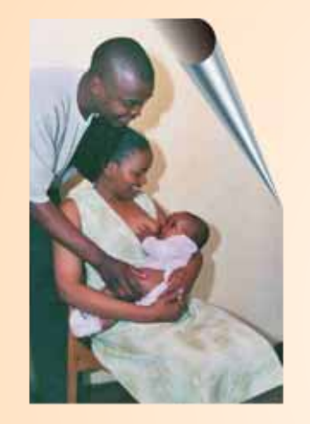
Infant and Young Child Feeding Policy